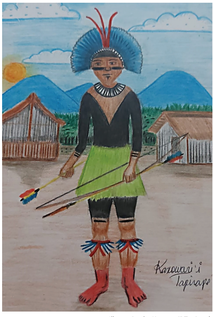
Illustration by Kaxowari'i Tapirapé.

In the vastness of the cerrado, an enchanting scenario unfolds, where the whisper of the leaves and the song of the birds compose an ancestral symphony, Aranã lives. About to come of age, the young warrior of the Xucuru-Kariri ethnic group, known for his unwavering determination and incessant curiosity, prepares for the grand celebration in the village.