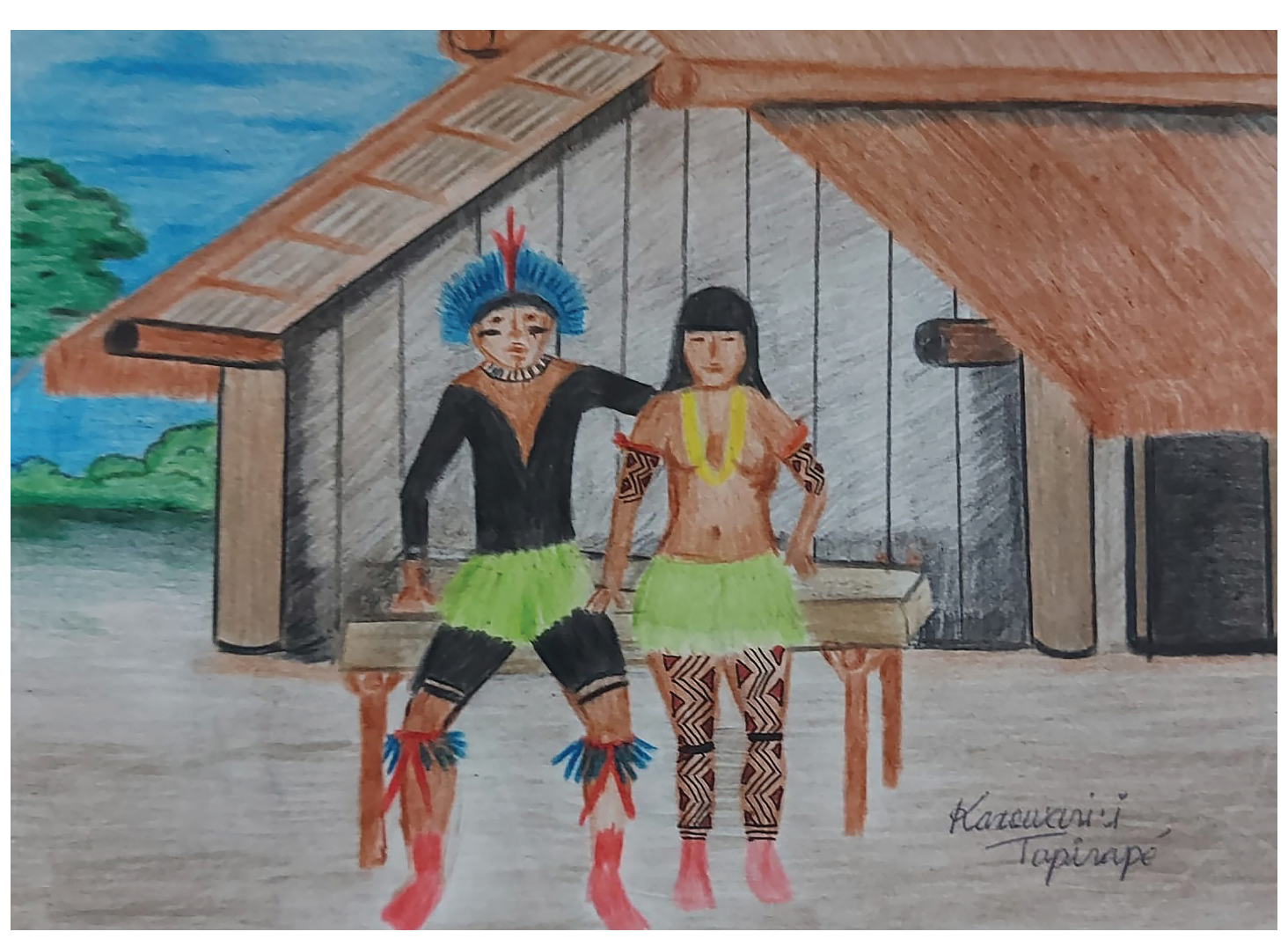
Illustration by Kaxowari'i Tapirapé.

The story of young Anahí Kariri and young Aranã Xucuru-Kariri was not only about resistance, but also about renewal and prosperity. They showed that it is possible to create a future where progress and tradition go hand in hand, and where love for the land and ancestral culture is the driving force for a more just and harmonious world. Their legacy inspired generations.