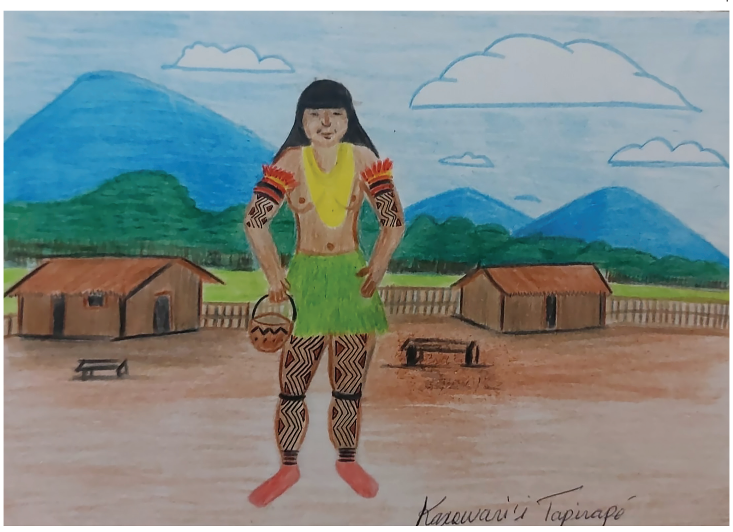
Illustration by Kaxowari'i Tapirapé.

trance that connected them even more with nature and their ancestors. The young Xucuru-Kariri realized that this union symbolized a collective force, in which differences dissolved in favor of a common goal: the strengthening of their ethnic groups and the creation of a great nation of the Northeast.