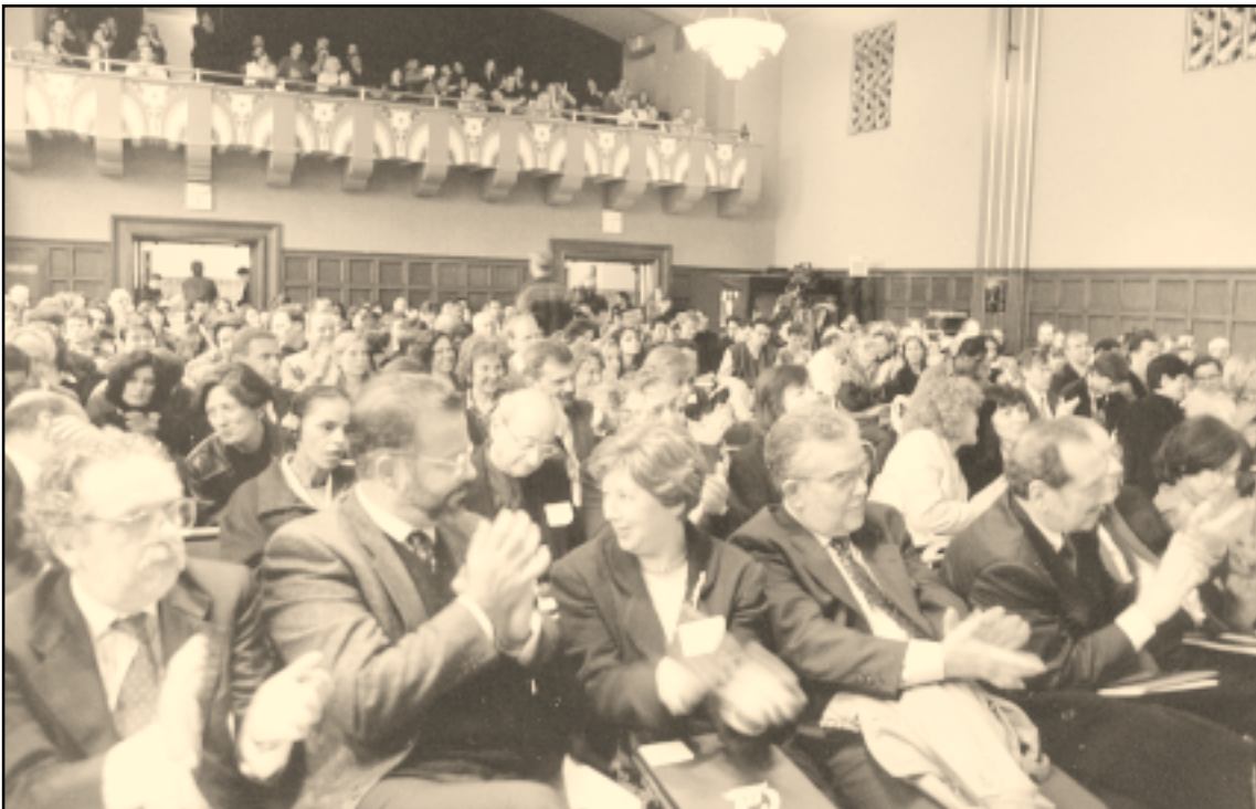
Conference attendees filled the auditorium