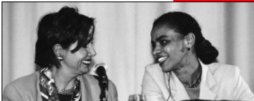
From left to right, Rep. Nancy Pelosi and Sen. Marina Silva

larly the Workers’ Party — for its reluctance to work in coalition with the party of President Fernando Henrique Cardoso. Cardoso was elected with support from conservatives and economic liberals, and according to Minister Jungmann, has presided over an ambitious program of agrarian reform that has already provided more families with land than in all previous administrations combined. “A smaller base, or a base made up exclusively of the left, would probably not have produced the same results,” Minister Jungmann explained, in praise of the broad political coalition on which Cardoso’s government is founded. “This is because the conservative sectors, or the right-wing sectors, wrapped up together as opposition, would recover power and veto ability outside of a pact like this.” He highlighted accomplishments of the land reform project: family agriculture today accounts for 13.8 of 17 million jobs in the countryside, and the cost of land has been dramatically reduced. Among other initiatives, Minister Jungmann discussed federal low-interest loan programs and discounts in land price for families who keep their children in school. He pointed out that these achievements were made possible, in part, because of the weakening political power of traditional landed classes, which have been forced to accept major defeats such as the federal government’s reclaiming of 93 million hectares of illegally seized lands.