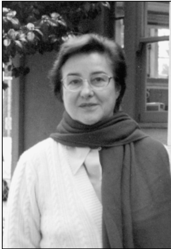
Dr. Ruth Cardoso

While thinking broadly is essential in a country as large as Brazil, Comunidade Solidária addresses issues in different ways in different communities, Dr. Cardoso explained. The organization interacts with public programs but maintains the support of individual communities because it is funded partly by the federal government and partly by local