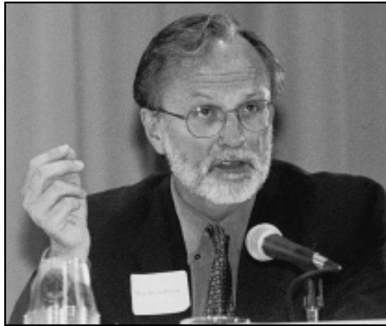
Rep. David Bonior

Prof. Cristovam Buarque, on the other hand, insisted that growth must be subordinated to a larger concern: improving the quality of life for the majority of the population. The eradication of poverty, he argued, constitutes the principal