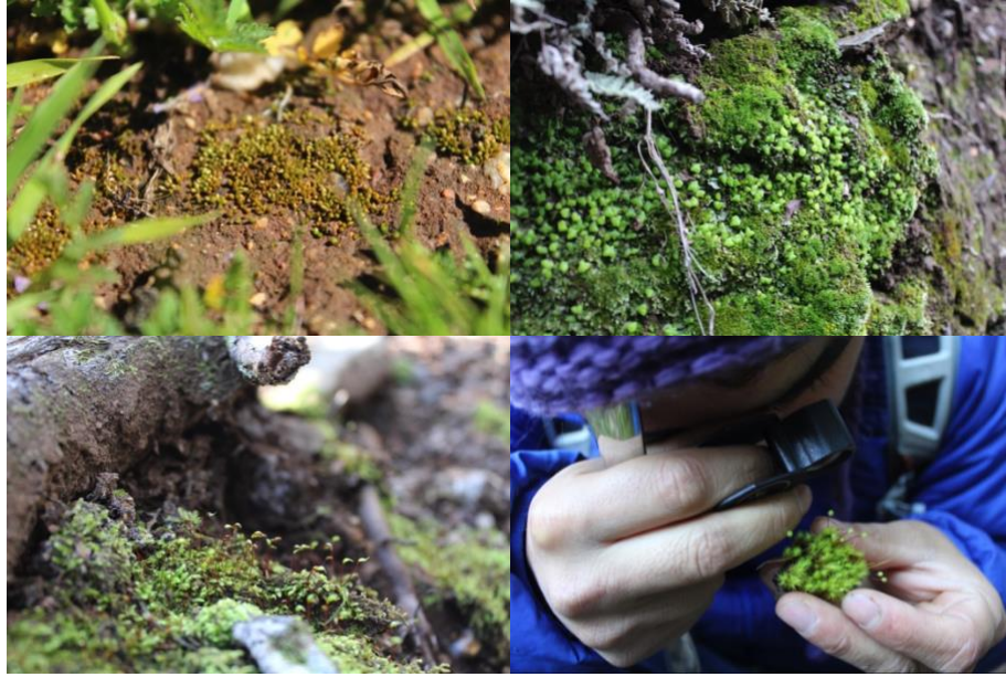
Fig. 4 A: Syntrichia sp. B: Costesia macrocarpa . C: Acaulon sp. D: Liverwort that needs identification. E: Eurhynchiella acanthophylla . F: Observing mosses through a hand lens.