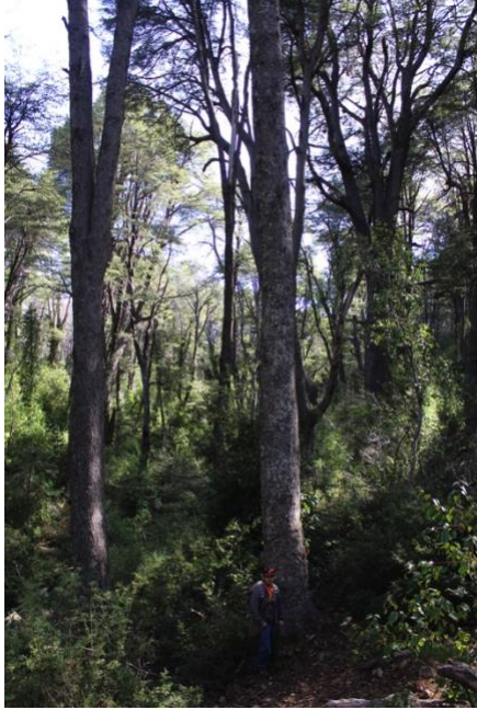
Fig 3. A mixed forest of Nothofagus dombeyi with sclerophyllous forest in Altos de Lircay, Region del Maule.