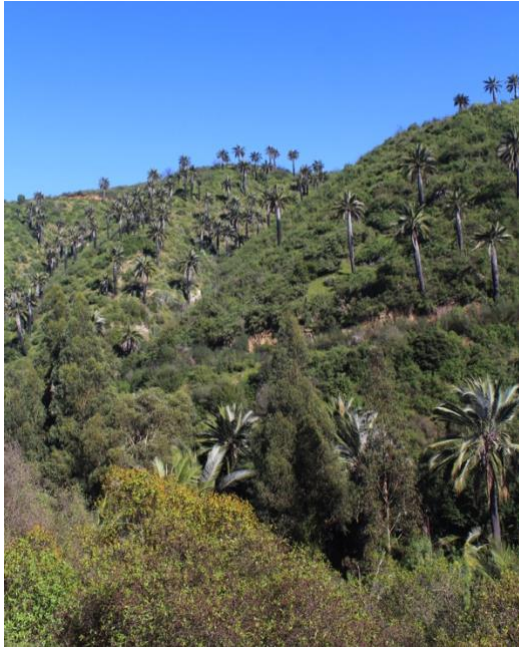
Fig 1. An endemic palm forest ( Jubaea chilensis ) in the coast range of Region de Valparaíso. An especial niche for bryophytes.

scientist and society to conserve the pristine forest of bryophytes in Central Chile, but also will encourage to people to carry their hand lenses to enjoy the beauty of a miniature forests.