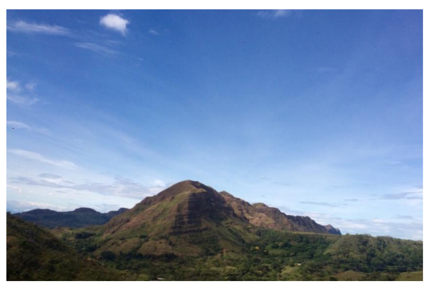
Photo 1. View of the mountains in the Magdalena River Valley region in the state of Tolima in central Colombia. Gold deposits located in the mountains and in placers have encouraged informal (mechanized) extraction of gold, July 2016.

capital, Bogota. Having talked with miners, public servants, journalists, and NGOs' members, I realized that illegal extraction of gold is a key scenario where the predicaments of the post-conflict transformations are constantly unfolding. During the last decade, the increment of global minerals prices transformed resources such as gold, platinum, oil, and coal in profitable, thereby disputed, assets. Colombia's mineral extraction grew and with it different sociocultural and environmental dynamics emerged. The unintended result of the Colombian mining boom was the proliferation of informal mechanized gold exploitations carried out by thousands<sup>4</sup> of rural inhabitants. They could be mestizo, black, or indigenous who (i) alternate agriculture and mining, (ii) are dormant peasants who temporarily give up to agricultural activities, or (iii) rural inhabitants that may never have practiced agrarian activities. Bulldozers and backhoes are the most used machines by these informal miners. They pair the digging labor with the use of mercury and arsenic to accelerate the separation of gold and soil. Altogether these practices are severely damaging crop lands, protected areas, and streams. Within the context of neoliberal extraction, these miners are unwanted rivals of large foreign companies.