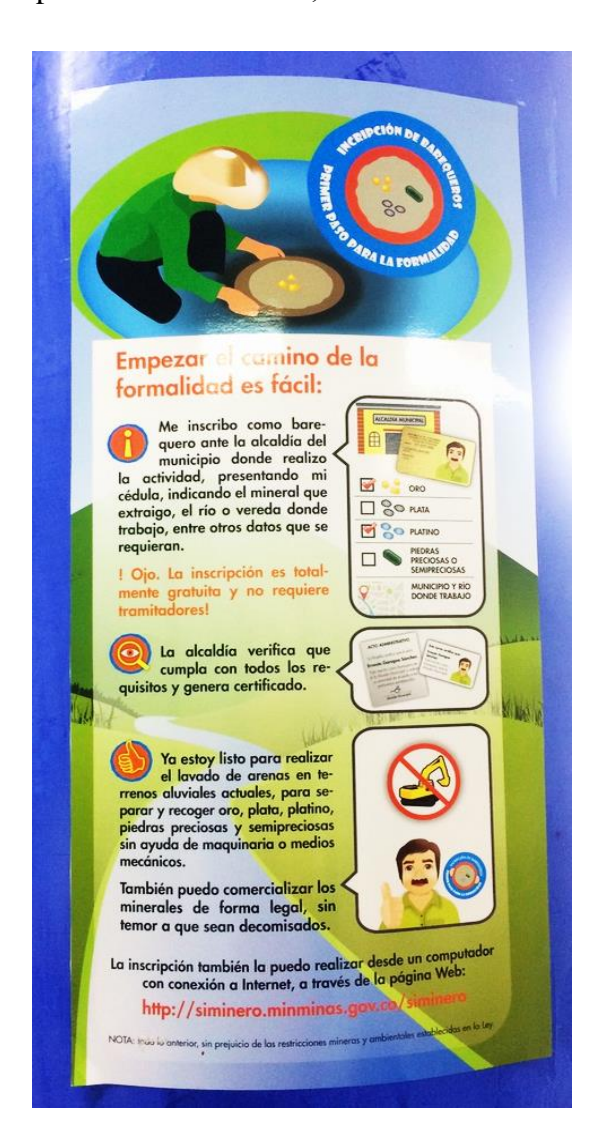
Photo 2. "Beginning the path of mining formalization is easy: (1) register as miners in the major office, (2) the mayor office verifies if the miner fulfills the requirements, (3) the miner is ready to work. Banner in the Tolima's state government office, July 2016.

projects that might serve them to drop gold production. However, the projects lack of funding; thus, they are transitorily undevelopable. In Bogota, the Ministry of Mines' and Agencia Nacional Minera's high officials hope that the ongoing national transformations (Photo 3), associated with the post-conflict scenario, contribute to "definitely bring informal miners into the domain of law".