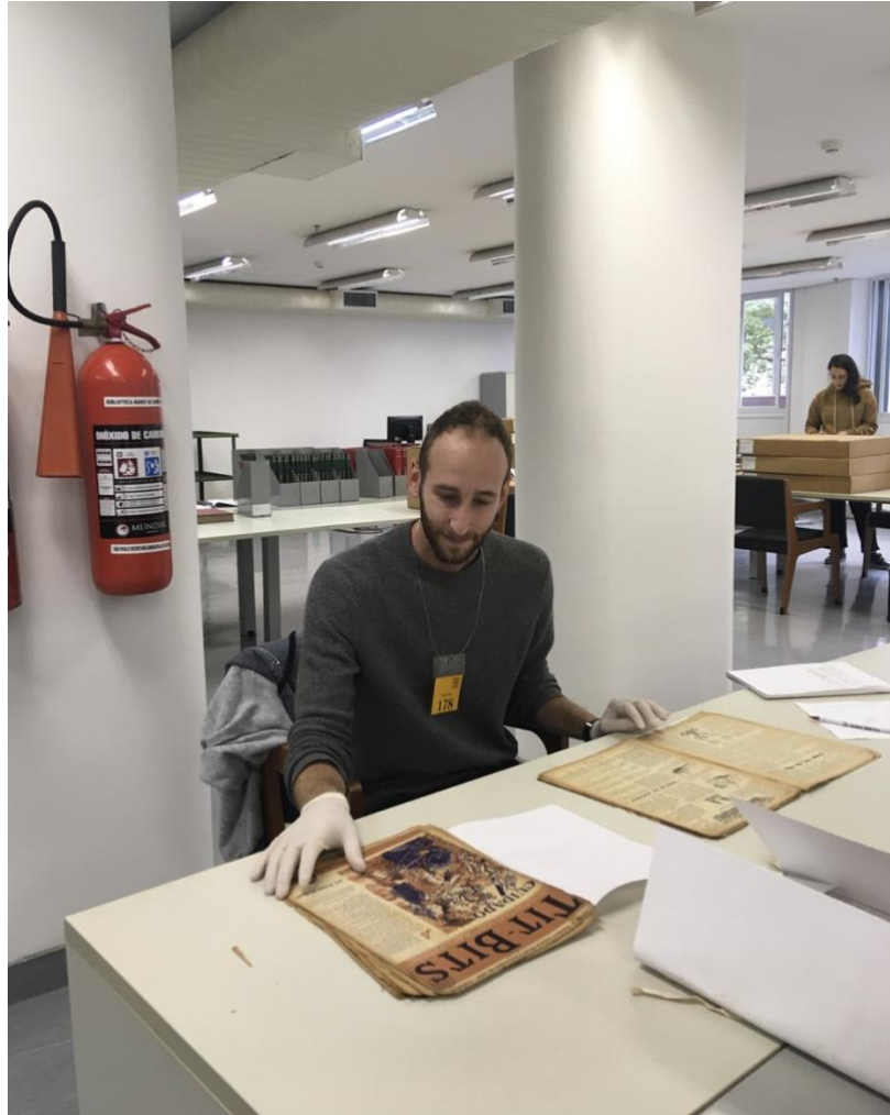
Researching Early 20 th century Humor Magazines at Mário de Andrade Library

This new insight shifted my direction in the archives. I began to examine mainstream, popular newspapers and magazines published during and before the dictatorship, regardless of political orientation. In these publications, cartoons were not acts of humoristic resistance but of oppression: homophobia, sexism, and racism were performed through jokes that reached a wider audience than those in clandestine resistance humor periodicals.