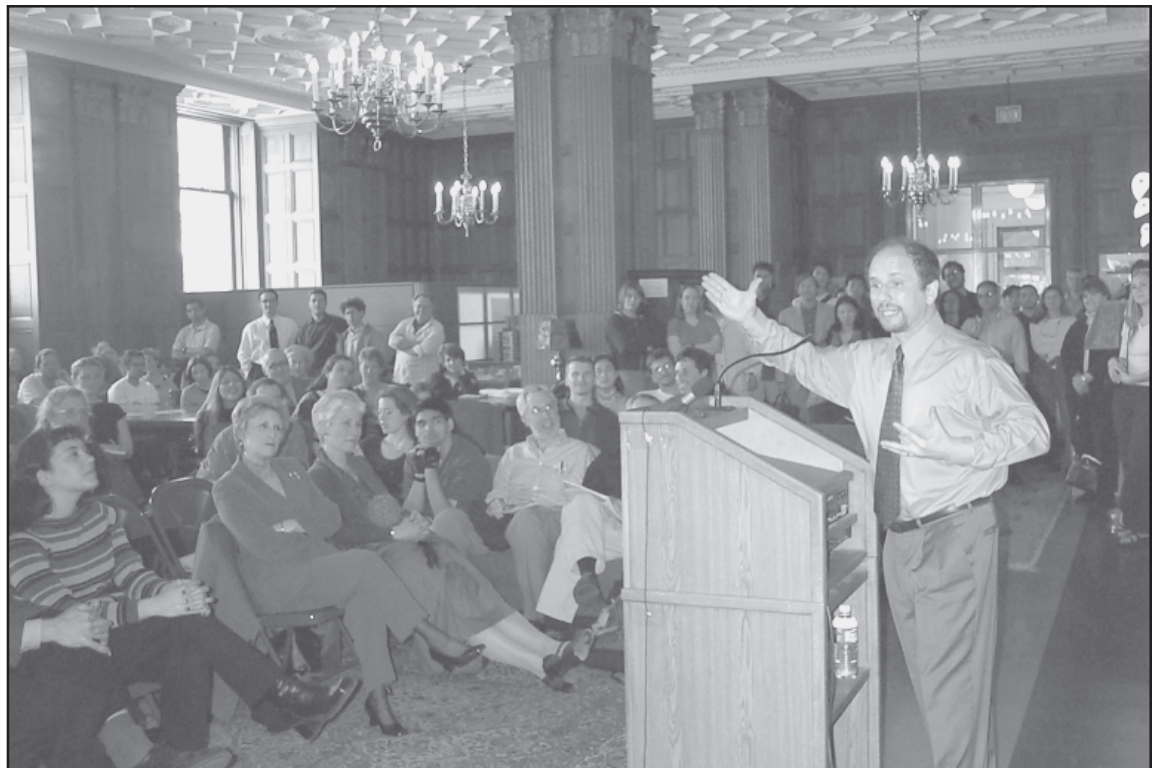
Right: Senator Wellstone in the Morrison Room, Doe Library UC Berkeley