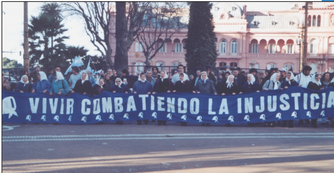
Left: Human Rights march in Buenos Aires, 2001 Argentina