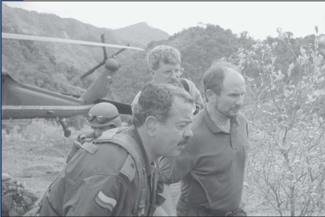
Above: Senator Wellstone in Colombia

One of the few U.S. Senators to oppose Plan Colombia, Wellstone has urged that any assistance to the country be conditioned on compliance with human rights norms, and expressed deep reservations about the potential effectiveness of a counternarcotics program that does not address the domestic demand for drugs. His views spring directly from his on-the-ground experiences in Colombia, as he explained during a spring 2001 visit to CLAS.