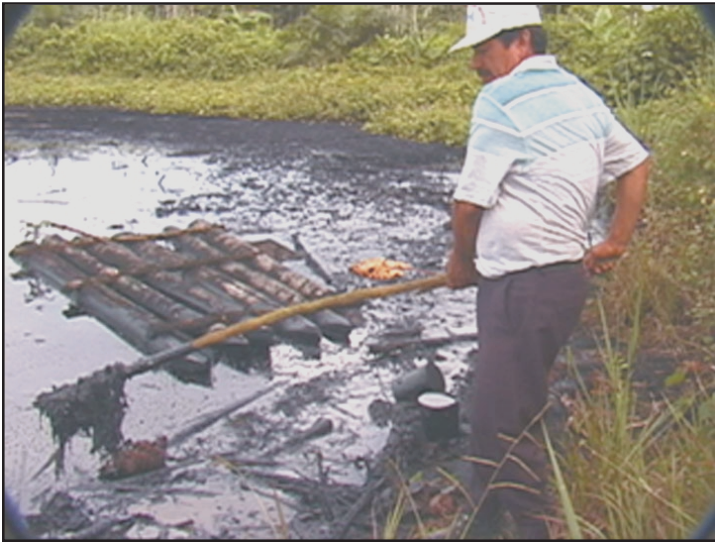
Left: The results of 30 years of oil extraction in Ecuador Ecuador