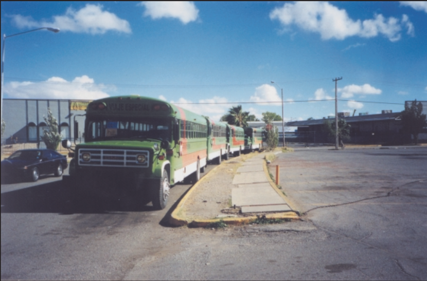
Above: Buses for maquiladora workers