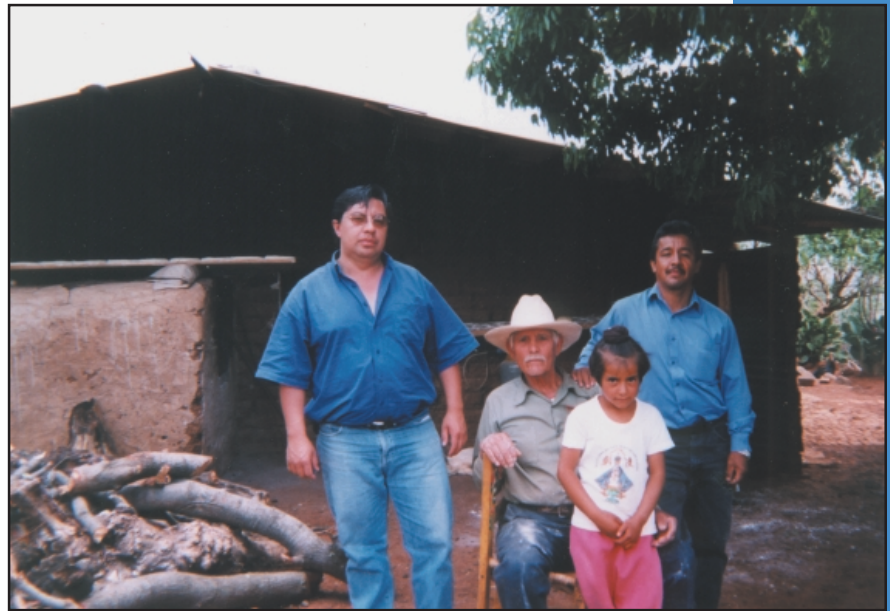
Right: A local authority of El Tecamate, Michoacán with his daughter and members of the Progresa staff Mexico