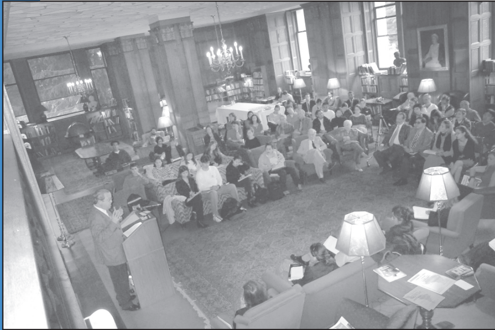
Above: Minister Weffort speaks at Berkeley

B y definition culture is particular to a society: it is a form of identification, what differentiates “us” from “them.” Yet identity and culture are never absolute; they shift and grow constantly, becoming ever more complex with the passage of time. At the same time, as Brazilian Minister of Culture Francisco Corrêa Weffort explained during a recent visit to CLAS, the creation of a relatively uniform sense of national identity constitutes a crucial part of nation building. On April 18, Minister Weffort shared a brief historical report of the politicization of culture in Brazil, providing insight on how the Ministry of Culture and other government institutions play a role in the propagation of Brazilian culture today.