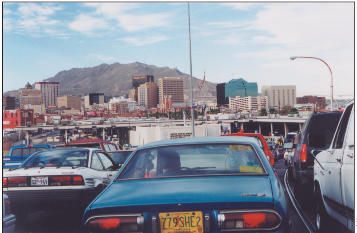
Right: Cars in line to cross the U.S. - Mexico border

port-oriented sector, the only motor of growth, has stalled for the first time in more than 12 years: the maquiladora sector lost more than 90,000 jobs and, in May 2001, posted the worst annual growth rate since 1982. In this context, the economically active population will grow by around 1.2 million in 2001, whereas the economy will lose 800,000 jobs, totaling an employment generation deficit of 2 million. These trends are far from the promised 1.2 million jobs to