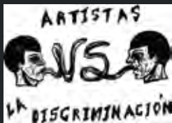
Artistas Contra la Discriminación