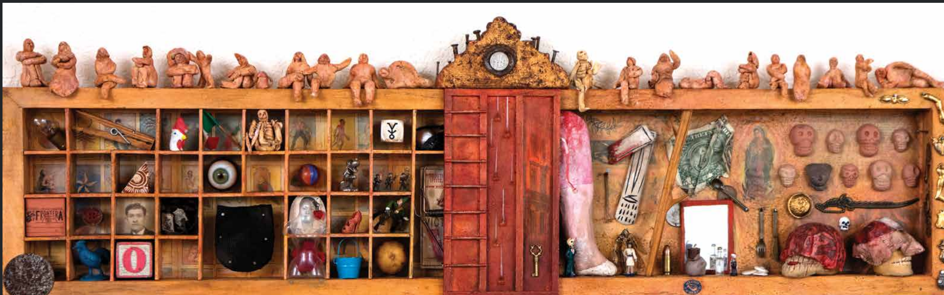
De Guatemala a Nicaragua, / de Honduras, México o Salvador, / La Bestia a diario lleva que lleva / From Guatemala to Nicaragua, / from Honduras, Mexico or El Salvador, / daily the Beast takes, it takes /