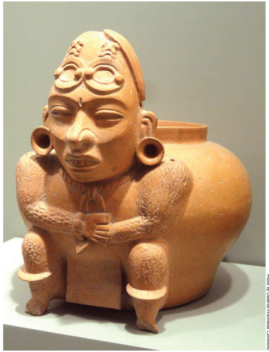
Thin Orange earthenware effigy jar from Teotihuacán.

Everyday life centered in apartment compounds that accommodated groups of single families. In the 1980s, Manzanilla directed archaeological investigations at Oztoyahualco — a three-household commoner apartment compound located in the northwestern periphery. Analysis of apartment floors archaeologists identify kitchen residues and food remains. They unearthed artifacts that showed that residents made tortillas and prepared meals with squash and maize. Households were selfcontained, but artifact distribution