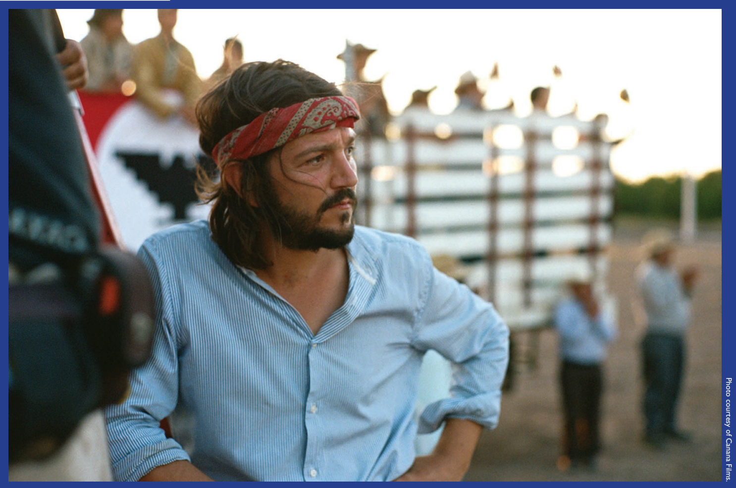
Diego Luna on location during the filming of "Cesar Chavez."