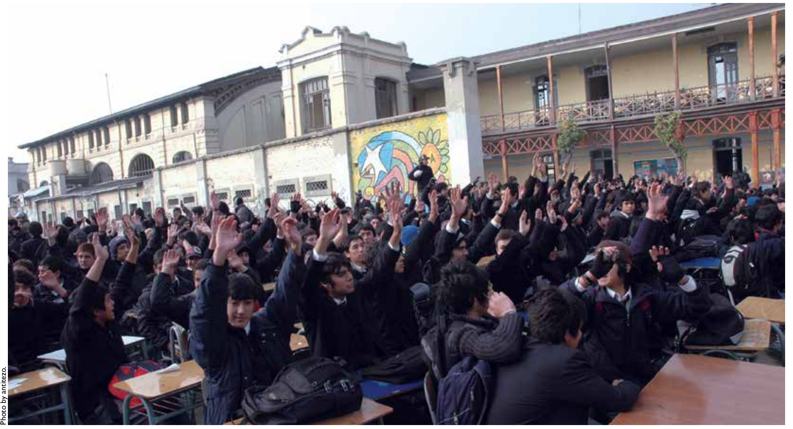
Chilean students protest by dragging their desks into the school courtyard during the 2006 "Penguin Revolution."

Izquierda Autónoma was a political movement that primarily operated within universities. It claimed