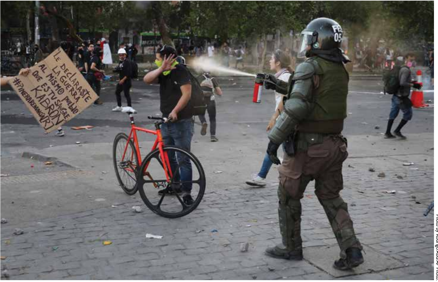
A Chilean carabinero pepper-sprays a demonstrator in Santiago, October 2019.