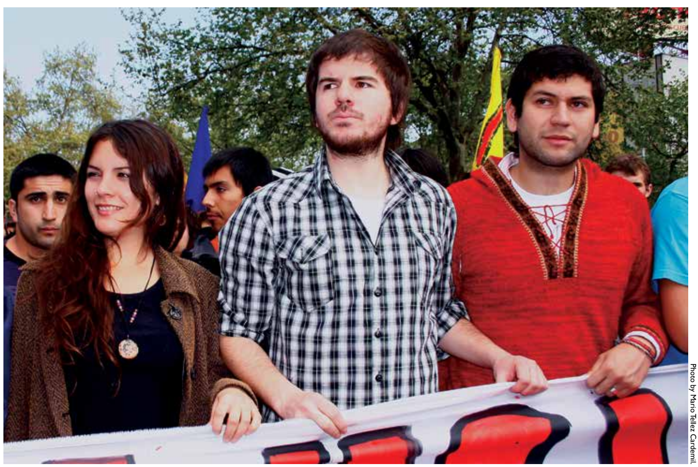
Three leaders of the Chilean student movement: Camila Vallejo, Giorgio Jackson, and Camilo Ballesteros, September 2011.

government (2010-2014) cratered. Student movement leaders garnered popular support and legitimacy that challenged and even exceeded politicians from the traditional parties and incumbent coalitions, both the center-right government coalition and the center-left opposition.