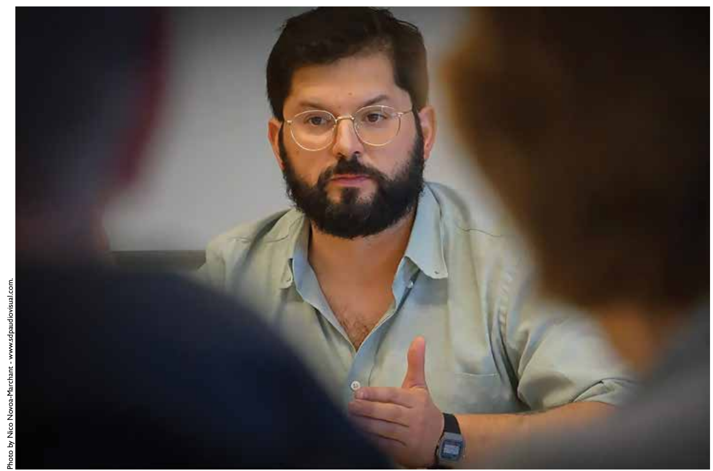
At UC Berkeley, Gabriel Boric explains the drive to re-write Chile's Constitution in 2020.

newly elected assembly would write the Constitution; under the latter, the assembly would be composed of standing parliamentarians and directly elected members in equal part. In either case, the convention election will take place on April 11, 2021. The convention will have nine months to do its work and could be postponed only once for three months. The final product should be submitted for ratification in a plebiscite expected in 2022.