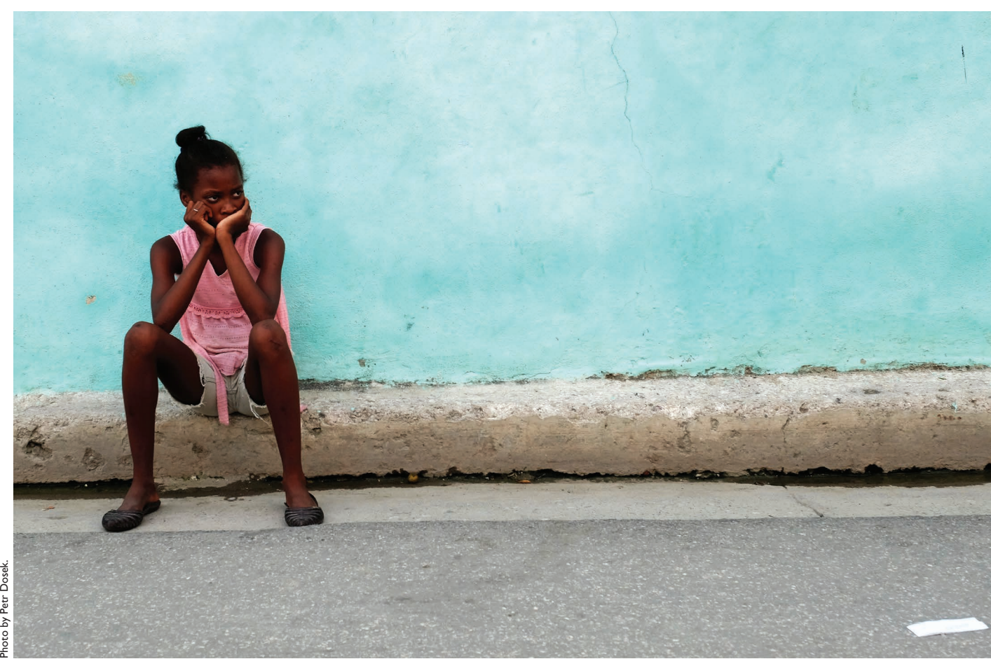
An "oriental" girl in Santiago de Cuba

Returning to a comparison of the tropes of blackness used to discuss Matanzas and Oriente, the former is constructed as the site of the most authentic and wellpreserved African-derived traditions, which is a positive discourse that alludes primarily to the past and historical phenomena. On the other hand, the racialized perceptions of Oriente are negative, in that easterners are often thought to represent a criminal, even foreign blackness. The "foreign" element is exemplified on one hand by the long history of Haitian migration to Oriente and the ways that Afro-Haitian culture is still widely viewed as outside