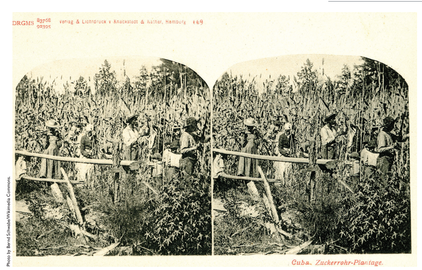
A stereoscopic image of sugar plantations in Cuba, circa 1900.

As mentioned above in relation to the term "palestinos," different cities and regions in Cuba are often associated with particular racial attributes. I refer to these notions as "racialized discourses of place," by which I mean the ways that regions and locales are linked with specific racial and cultural attributes. The common assertion that Oriente is the "blackest" region of the island