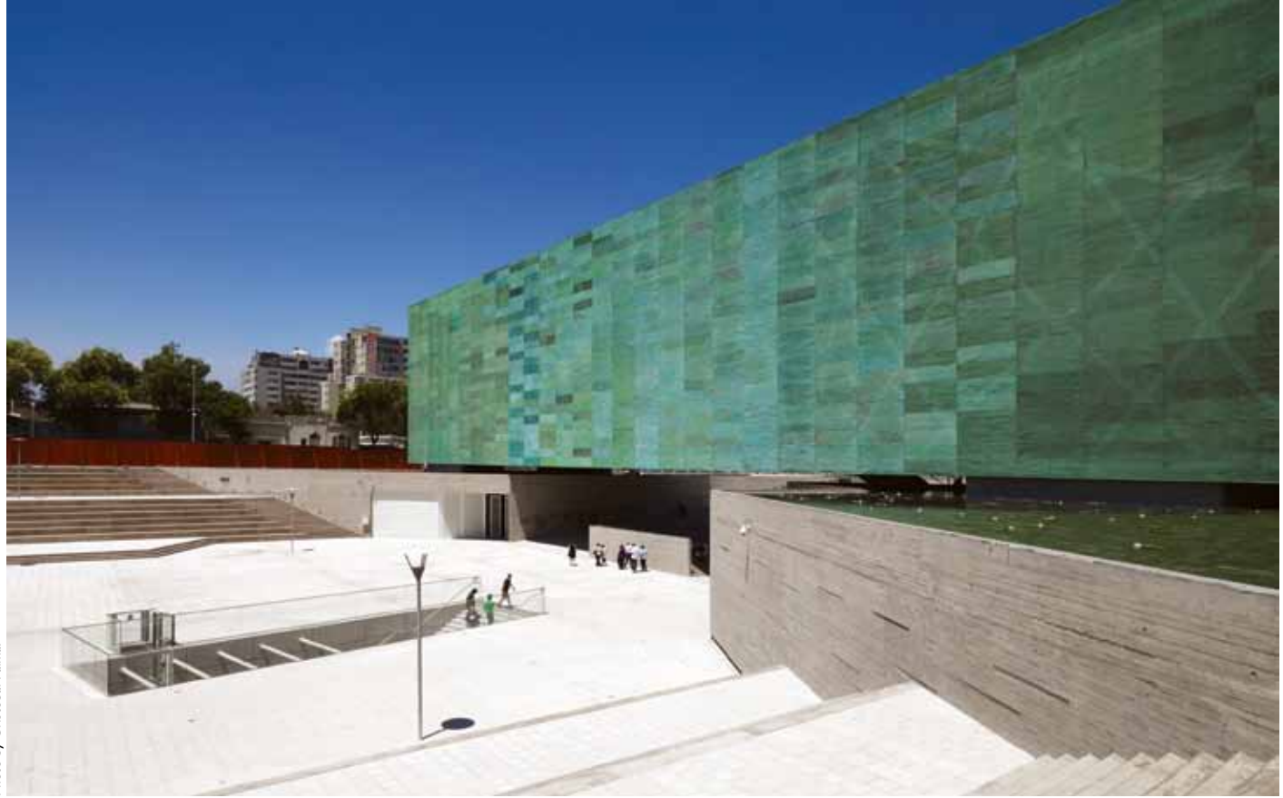
Chile's Museo de la Memoria y los Derechos Humanos.

However, that is the challenge going forward, not the end of the story.