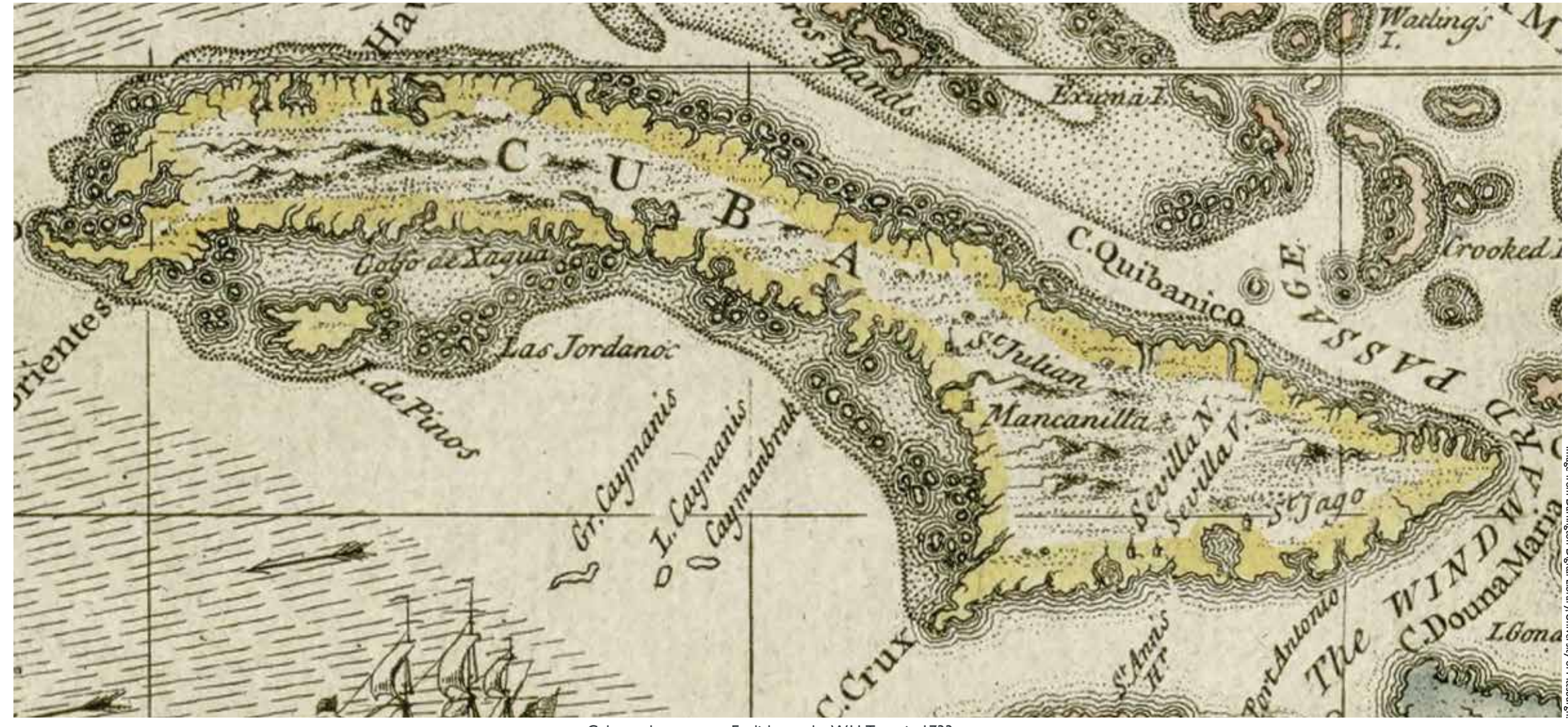
Cuba as shown on an English map by W.H.Toms in 1733.