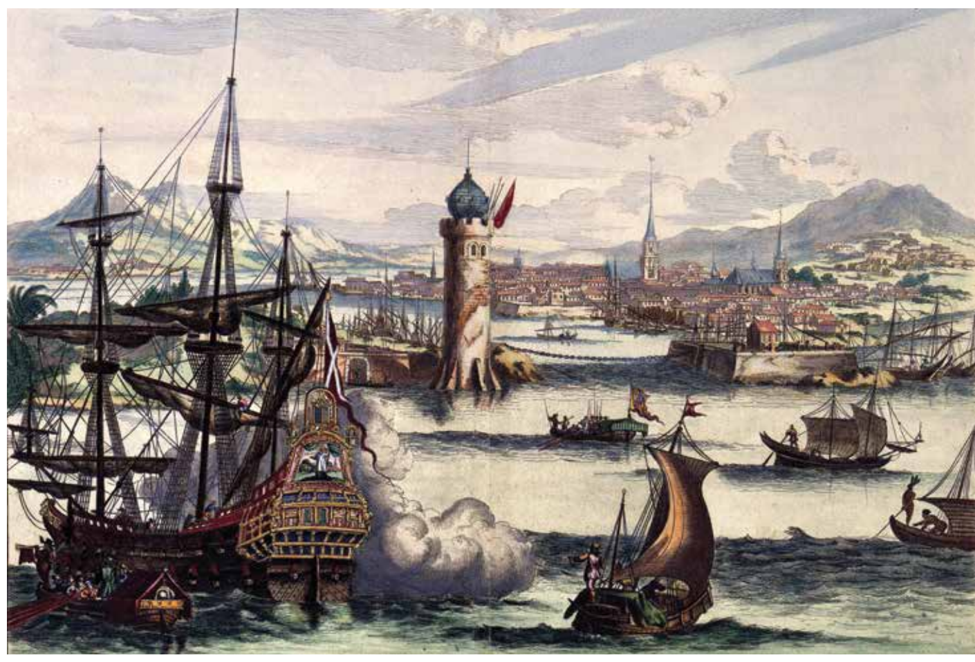
A fanciful rendition of Havana in a book engraving circa 1700.

The Black Legend of Spanish colonialism informed English animosity and provided motivation for these plots against Havana. The publication of Bartolomé de Las Casas's Brief Account of the Destruction of the Indies — with its numerous print runs in London and Amsterdam — convinced English readers of the moral rectitude of their project and the ease with which it could be accomplished. An Anglo-American liberatory complex animated the minds of those who imagined taking over the city and acquiring territories in Spanish America. Despite their own use of enslaved Africans and dispossession of indigenous populations, English adventurers imagined themselves as avengers and liberators of Spanish America's subjugated indigenous and African peoples, who, if given the opportunity, would rise up in arms and join them against their oppressors. When British forces successfully seized Havana in 1762, one English poet celebrated it as revenge for Cortés's defeat of Moctezuma II at Tenochtitlán.