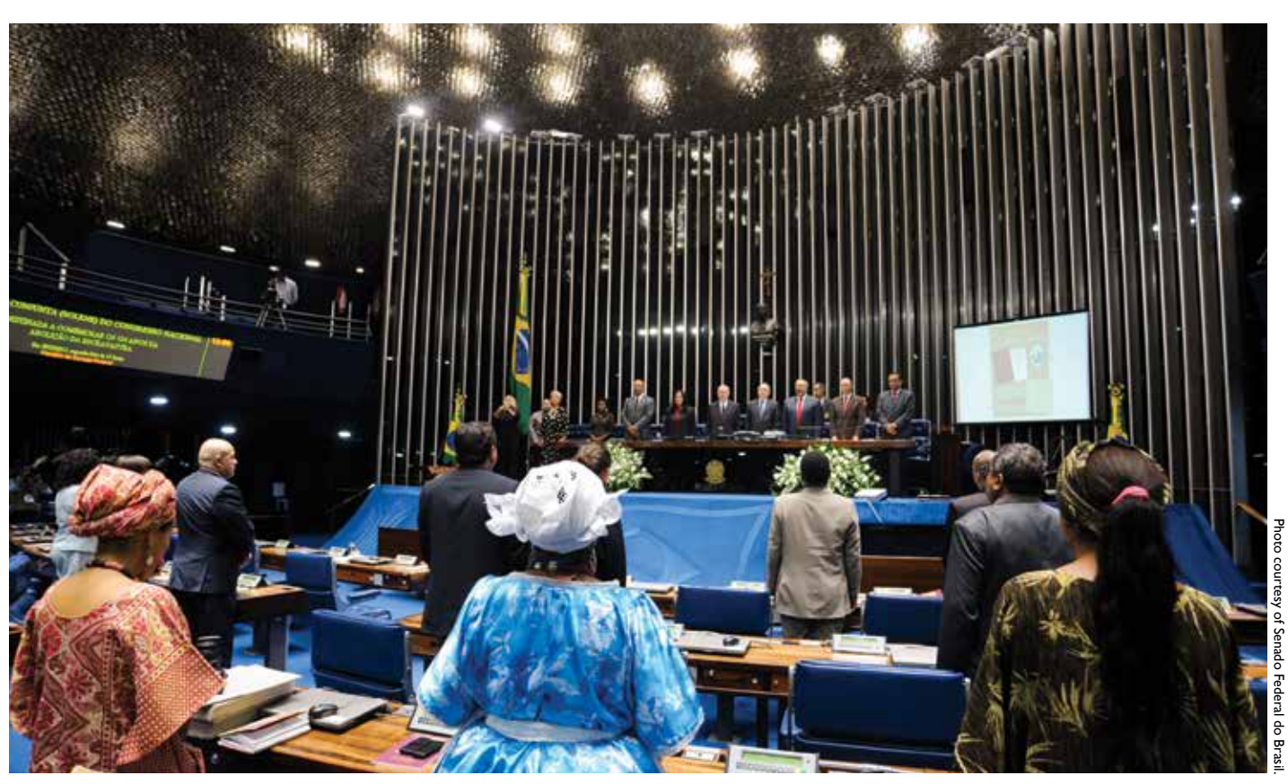
A ceremony commemorating the abolition of the slave trade in Brazil's senate chamber.

The Limits of Inclusion Spring – Fall 2016 | 57