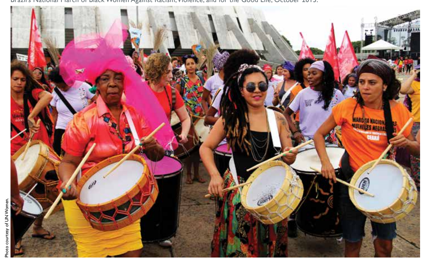
Brazil's National March of Black Women Against Racism, Violence, and for the Good Life, October 2015.

References for this article are available online.