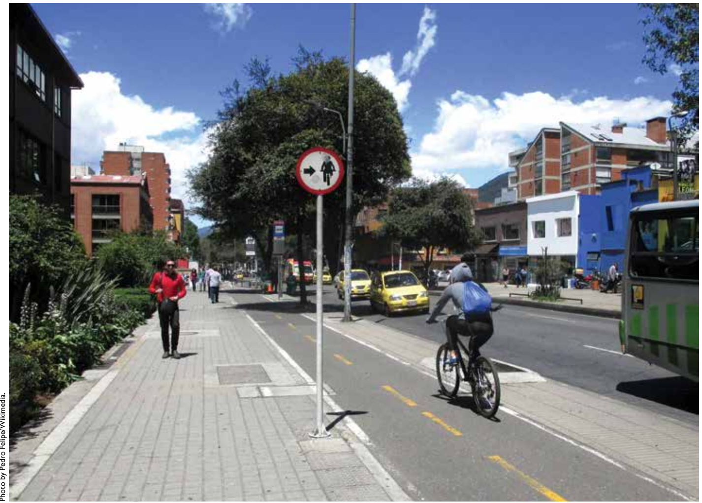
CENTER FOR LATIN AMERICAN STUDIES, UC BERKELEY

New pedestrian and cycling paths in Bogotá.