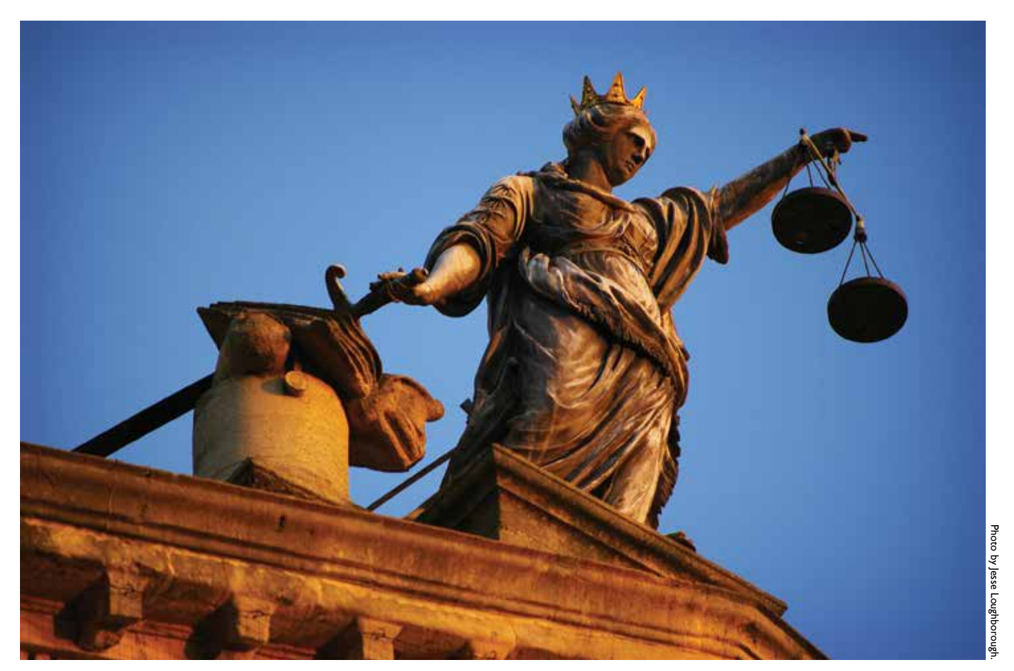
A statue of Justice holding her balanced scales.