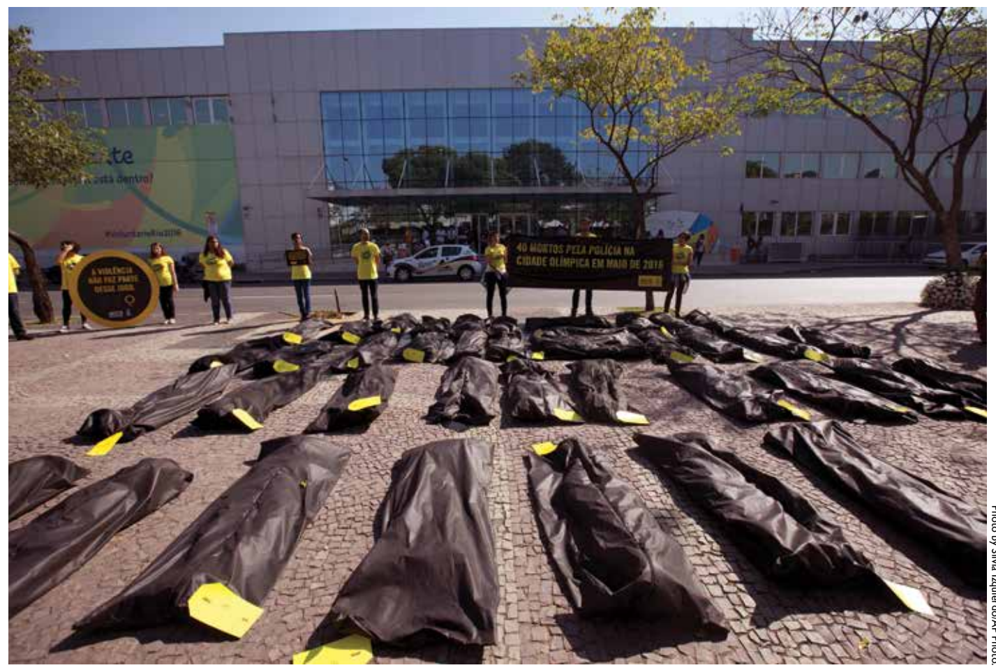
Body bags are used to represent victims in a protest of police violence in Brazil.

When it comes to the issue of judicial independence, there is a marked difference in the way different social sciences approach the problem. On the one hand, historians and anthropologists tend to be skeptical of quick fixes, viewing any change in this domain to be painfully gradual. On the other hand, economists, political scientists, and public policy scholars tend to be seduced by the promises of constitutional and institutional engineering.