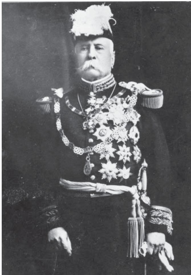
Porfirio Díaz poses in full dress uniform, August 13, 1910.

Another constitutional reform soon took place, removing the limits on reelection. Díaz was elected president in 1896, 1900 and 1904, this time to serve a six-year term. Then, in 1908, Díaz made a significant mistake: he gave an interview to an American journalist, James Creelman — which was published in both Mexico