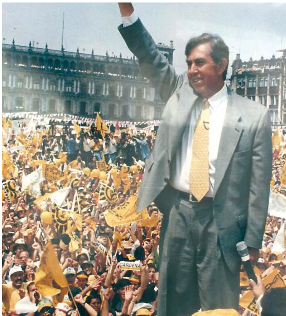
Cuahtémoc Cárdenas campaigns for Head of Government of Mexico City, 1997.

the PNR was a conglomeration of regional parties and regional political bosses that soon became the center of real power in Mexico. That power was exercised by Calles, who came to be known as the Jefe Máximo (Maximum Chief) during the six years after he left the presidency, a period known as the Maximato.