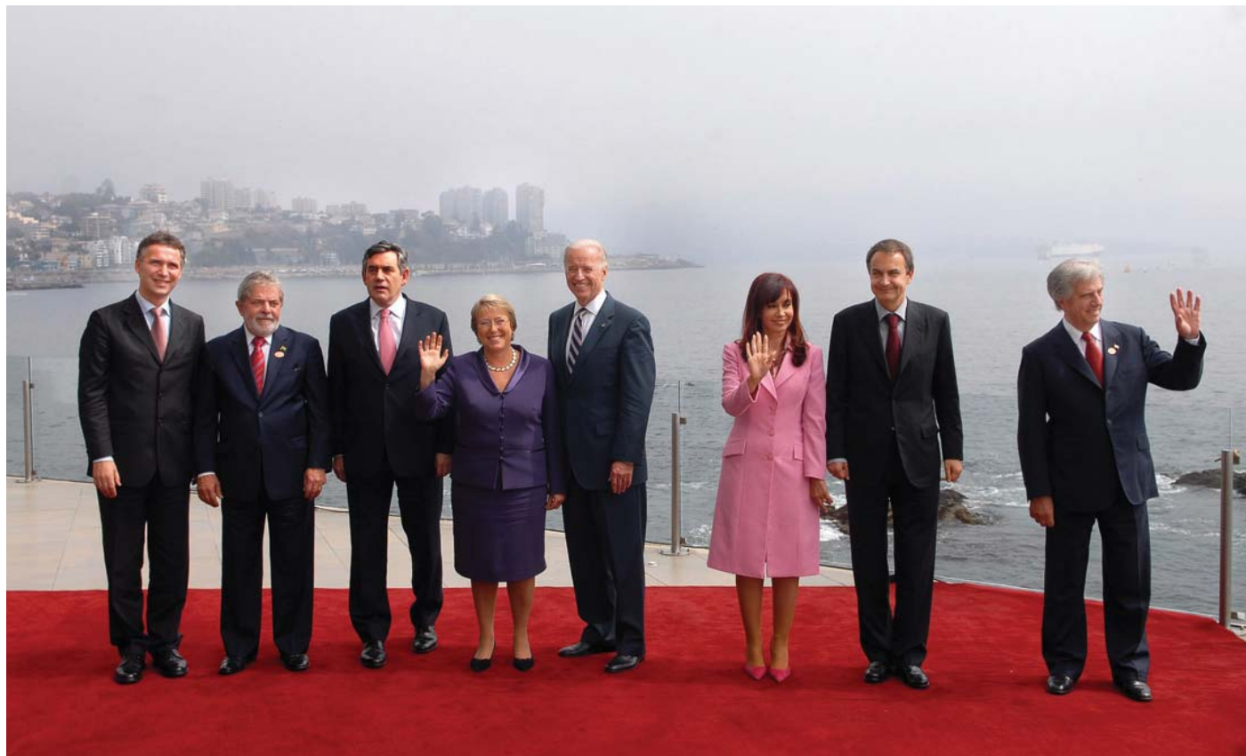
Government leaders at the 2009 Progressive Governance Conference in Viña del Mar, Chile.

Robert Reich is a professor of Public Policy at UC Berkeley and was Secretary of Labor during the Clinton administration. He spoke at the 2009 Progressive Governance Conference and Summit held March 26-29 in Viña del Mar, Chile.