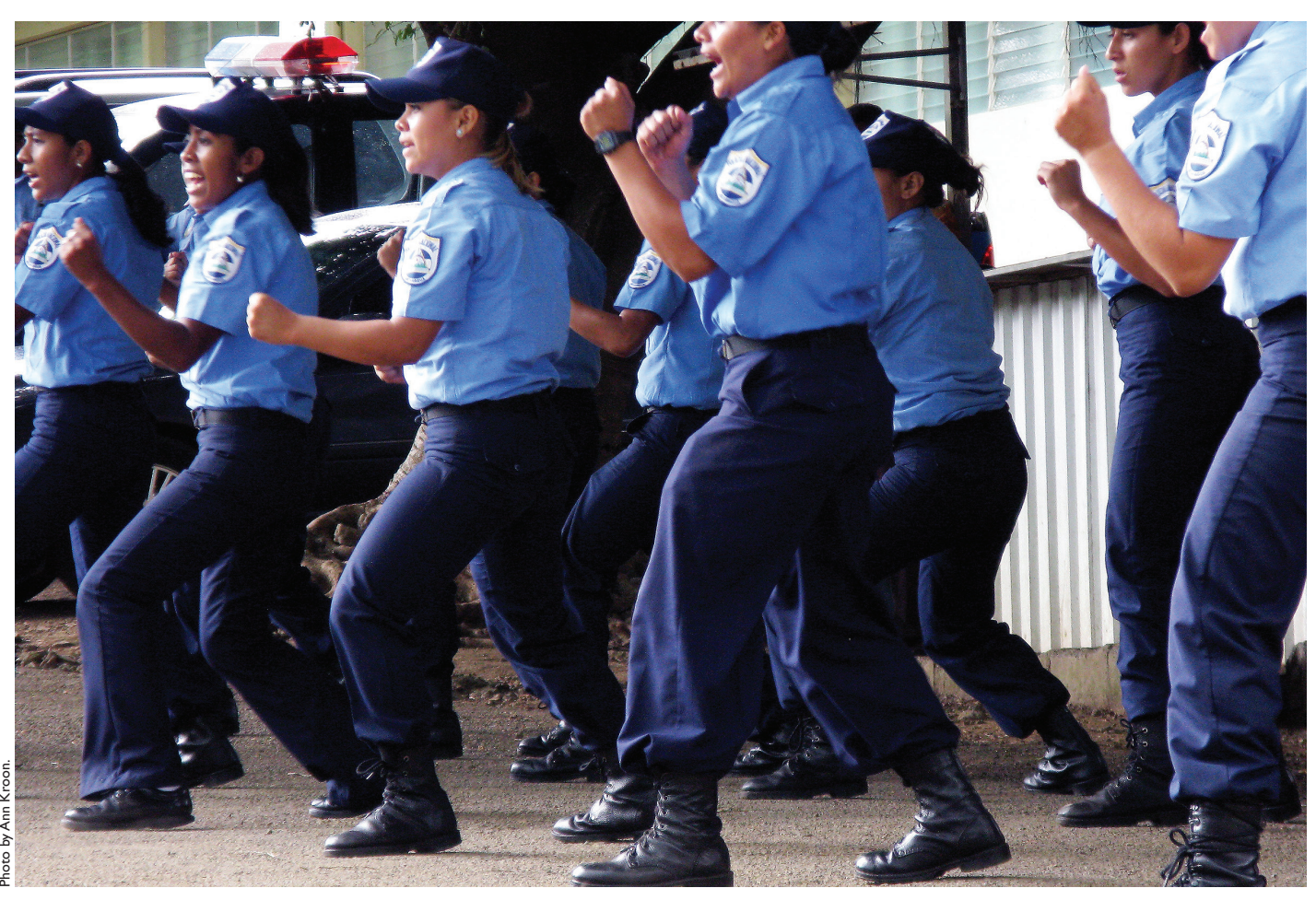
Nicaraguan police officers participate in a cooperative training session put on by the national police academy and the Swedish police force.

equitably. What is more, homicide rates in Latin America are actually much higher than the region's average level of inequality would predict.