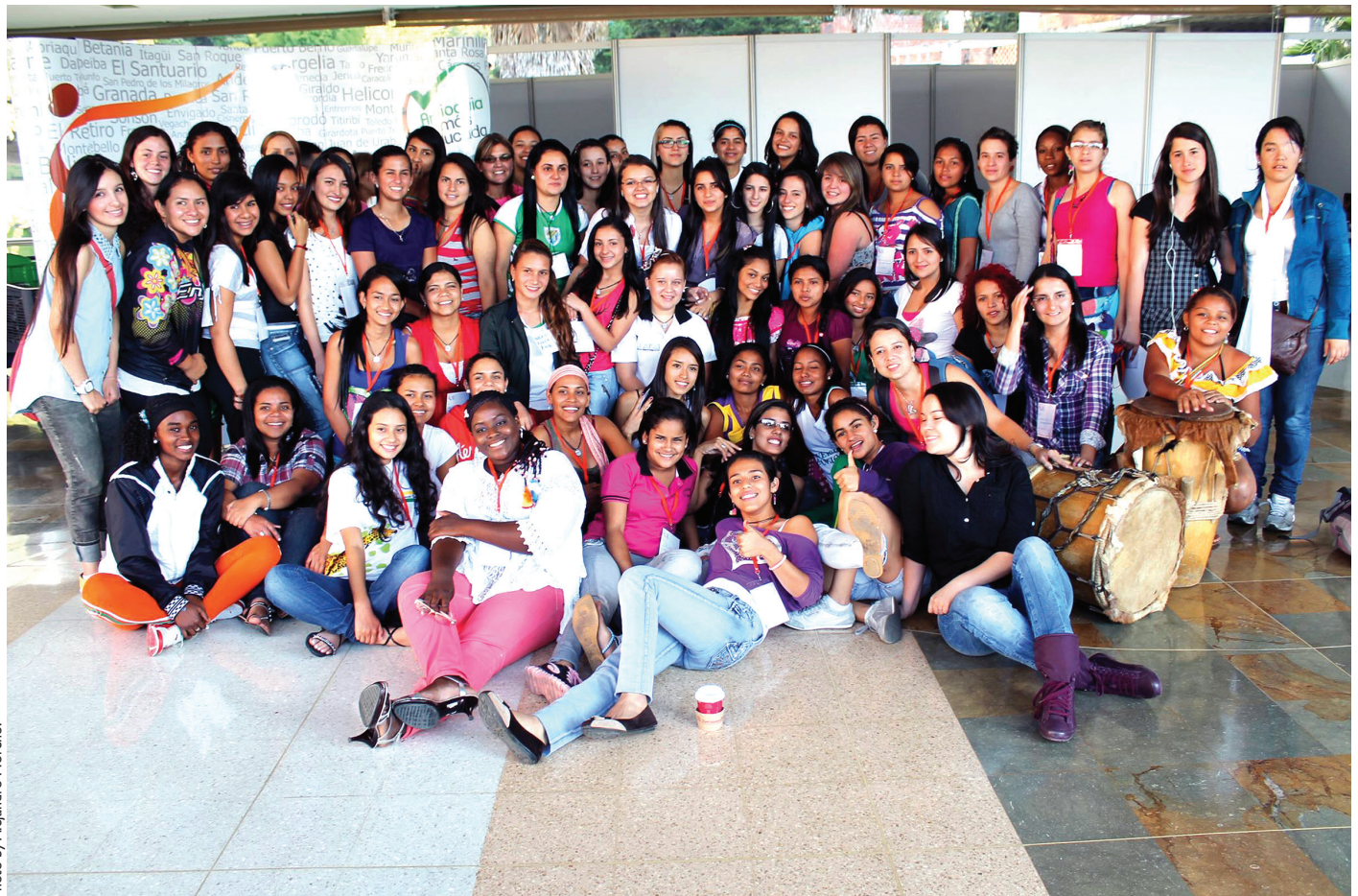
Finalists in Antioquia’s “Talented Women Contest.”