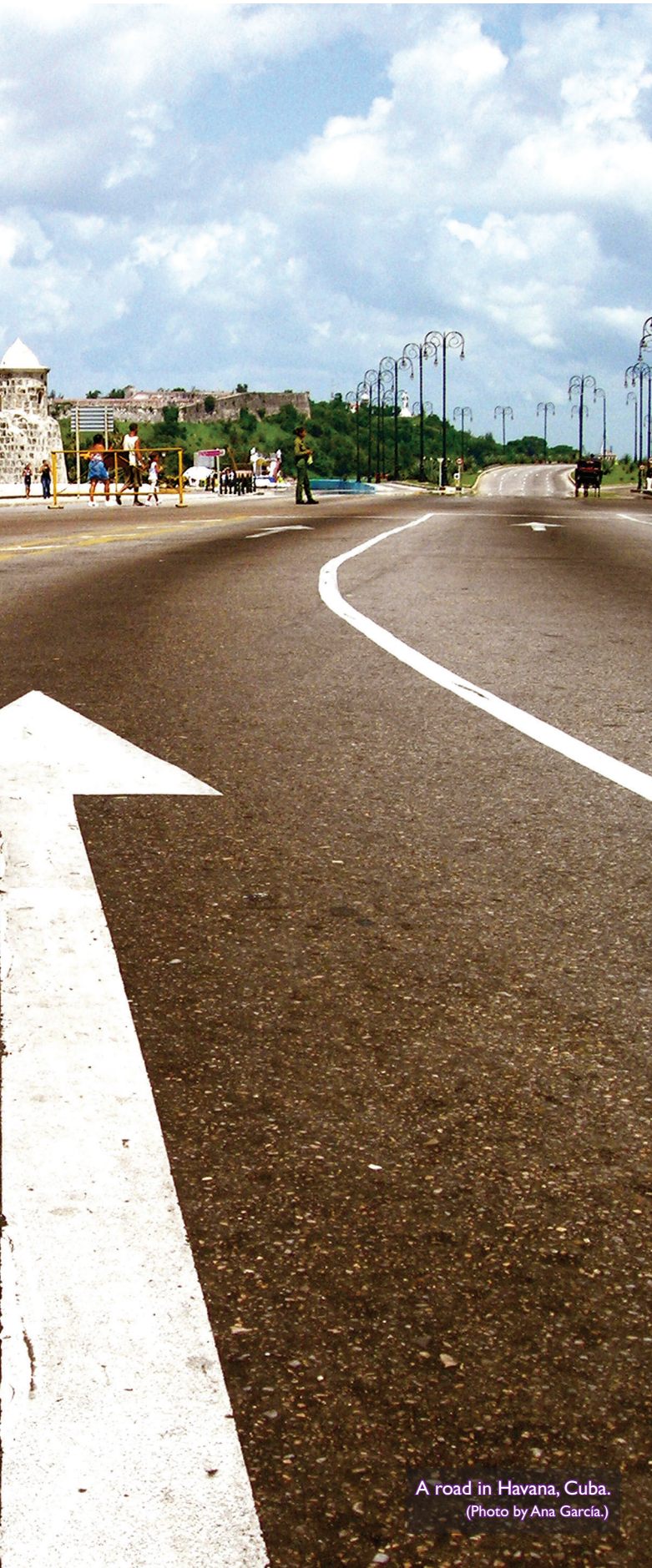
A road in Havana, Cuba.

for U.S. foreign policy. By burying the enmity of the past, the president has freed future policymakers to pursue substantive national interests as they relate to Cuba, among them: counterterrorism, counternarcotics, immigration, and environmental cooperation. Under a normal rubric of relations, Washington will also advance its interests, and investments, in economic development on the island as Cuba restructures its economy from strict, state-centric socialism to a capitalist-oriented system.