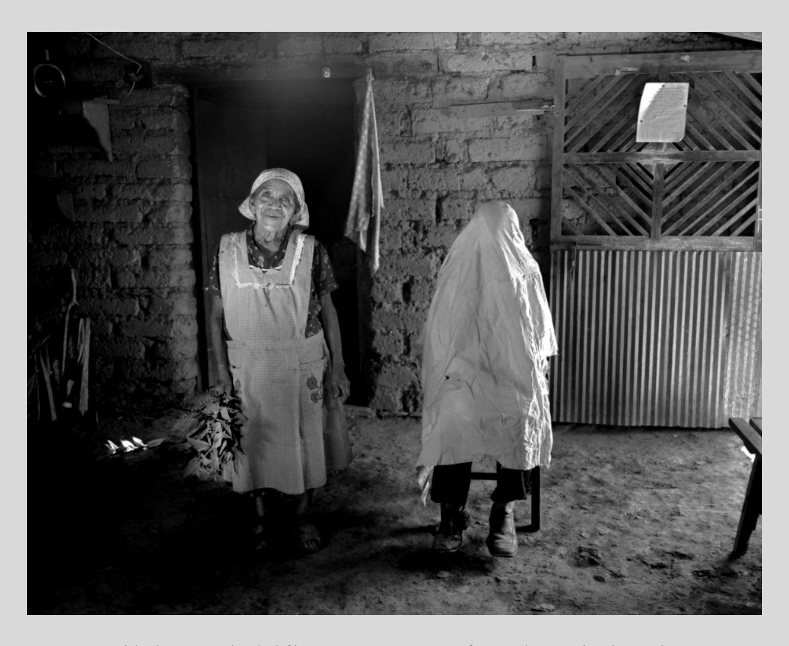
A healer or curandera (at left) prepares to treat a patient for susto (stress-induced trauma).