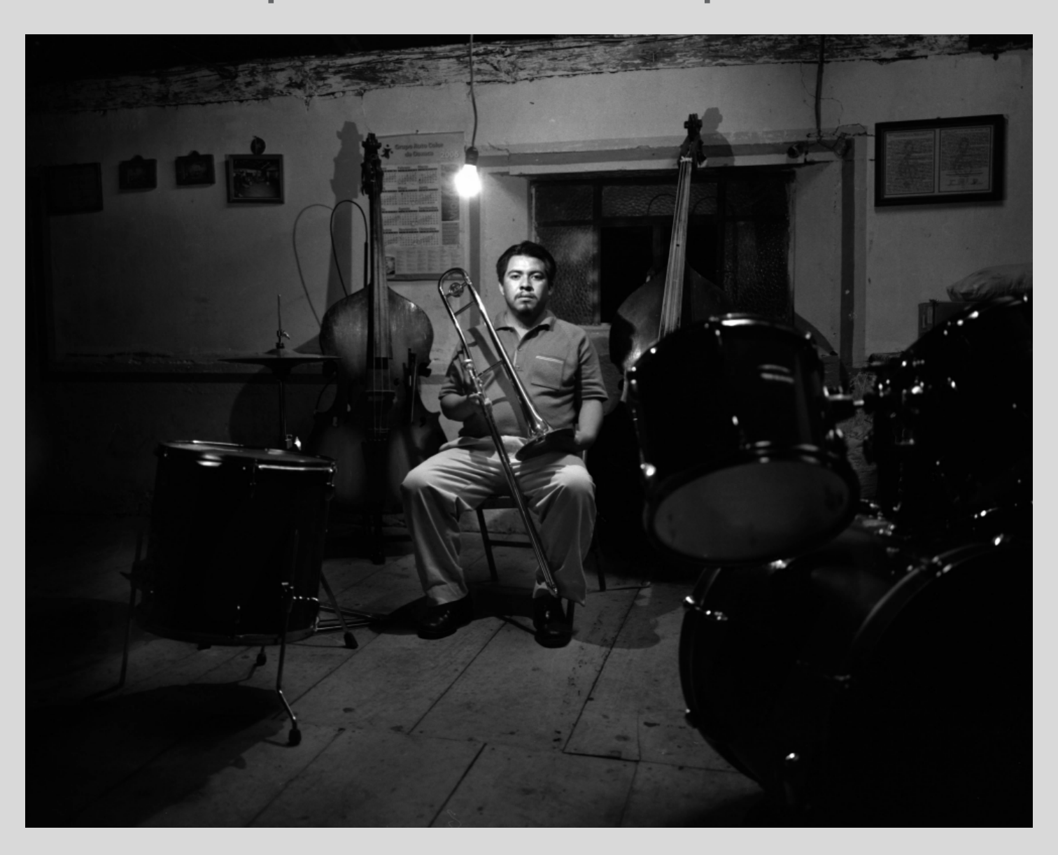
Zapotec musician.