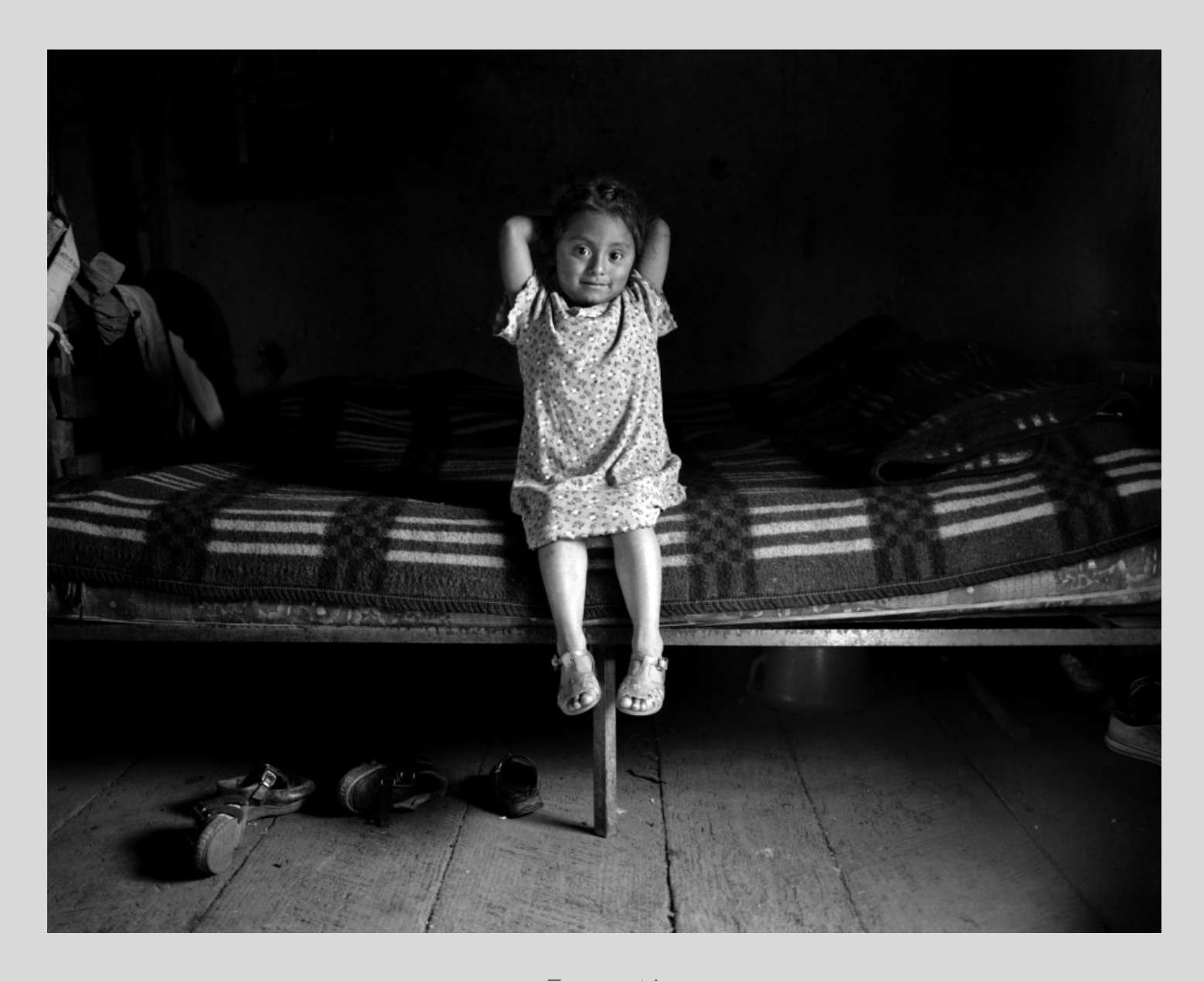
Zapotec girl.