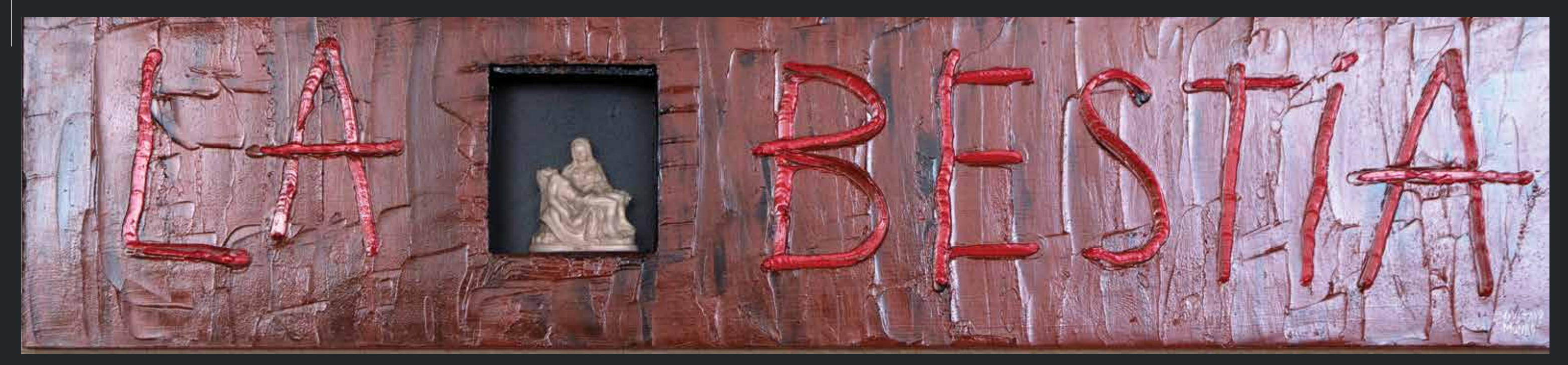
Esta vez, no me tirarás, / no soltaré las riendas, / This time, you won't buck me, / I'll hold on to the reins,

A group of 100 artists came together to create this exhibition as the collective Artistas Contra la Discriminación. They organized around the principle that discrimination is a cancer, and we are all responsible for identifying and eradicating this sickness