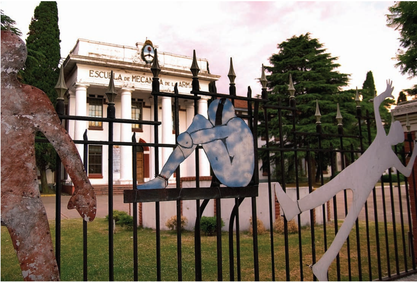
A memorial to torture victims in front of Argentina's Escuela de Mecánica de la Armada (ESMA).