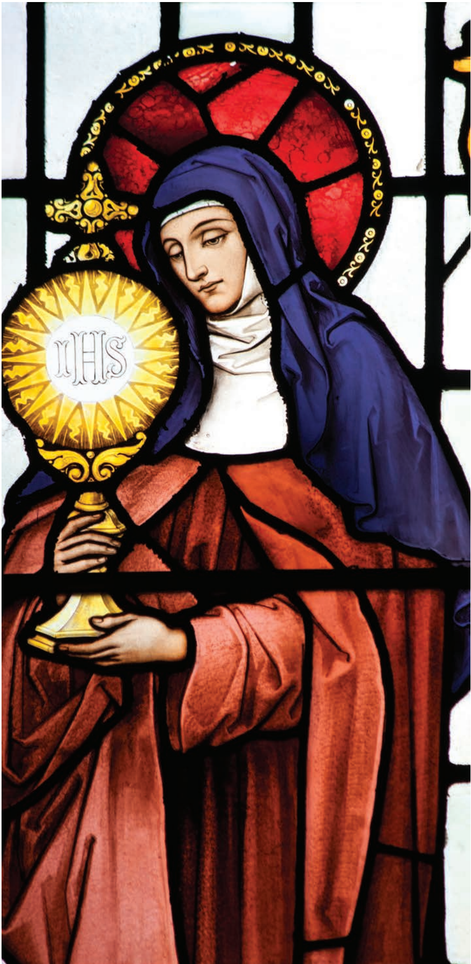
St. Clare, St. Frideswide’s Church, Oxford.