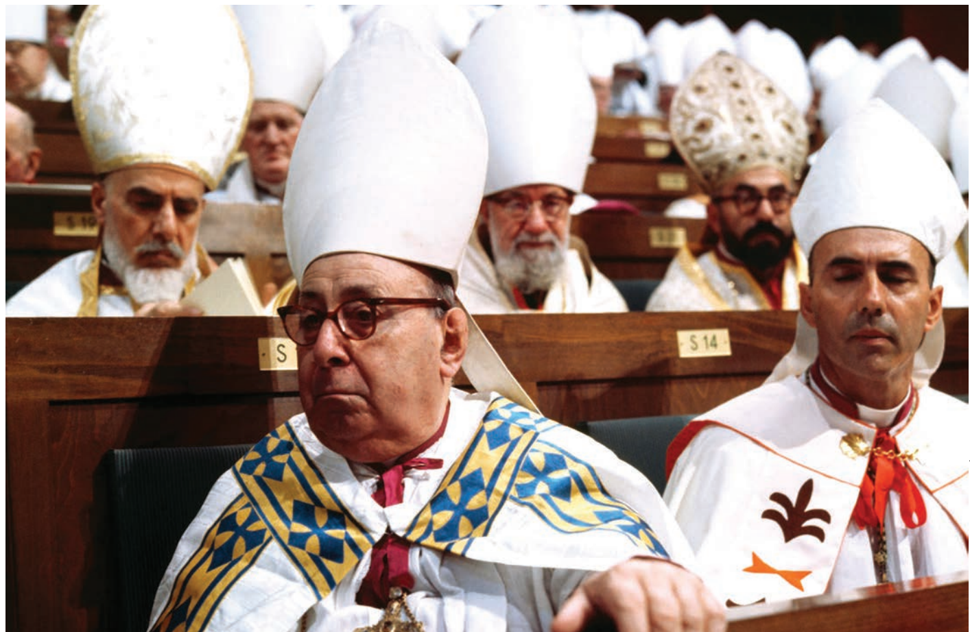
The Second Vatican Council (Vatican II) in 1962.

military dictatorships in South America in the 1970s and 1980s. At the 1968 Medellín Conference of Latin American bishops, liberation theologians took their message further into what this might mean in terms of everyday pastoral practice. The bishops pledged themselves to a new spiritual/social contract called a “preferential option for the poor,” which required the Latin American Church to detach itself from its colonial moorings and its favoritism toward the power elites, the landowning and industrial classes. The practitioners of liberation theology called for the growth of “ecclesiastical base communities” in favelas , poor barrios , and shantytowns where Catholic clergy and nuns working closely with lay people would read and discuss the scriptures as political as well as theological texts. Poverty and hunger were recast as “structural violence” and as social sins to be challenged and expunged. Liberation theology reconciled Christianity and social Marxism at a time when right-wing dictators overthrew democratic socialist political leaders with the help of the CIA and the U.S. Congress.