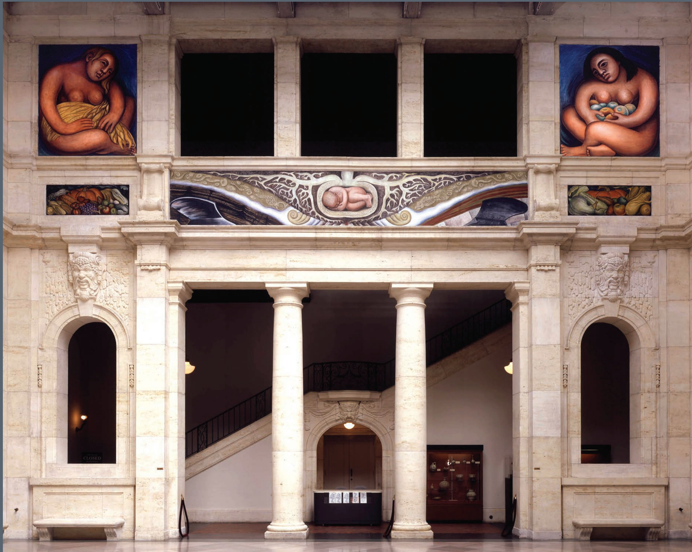
Left: Diego Rivera, "Detroit Industry," east wall, 1932-33, fresco.