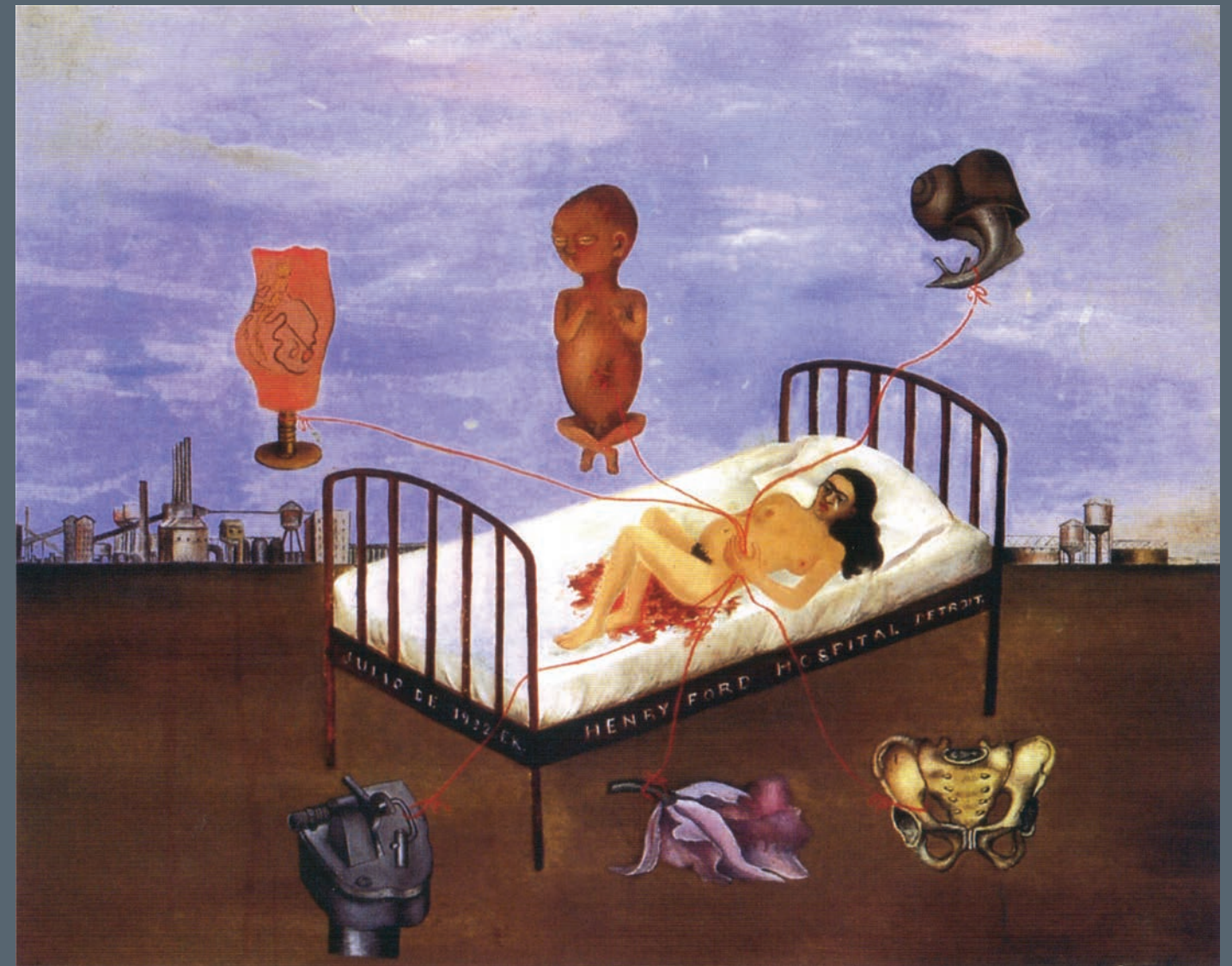
Frida Kahlo, "Henry Ford Hospital ( La cama volando )," 1932, oil on canvas.

© 2014 Banco de México Diego Rivera Frida Kahlo Museums Trust, Mexico, D.F. / Artists Rights Society (ARS), New York.