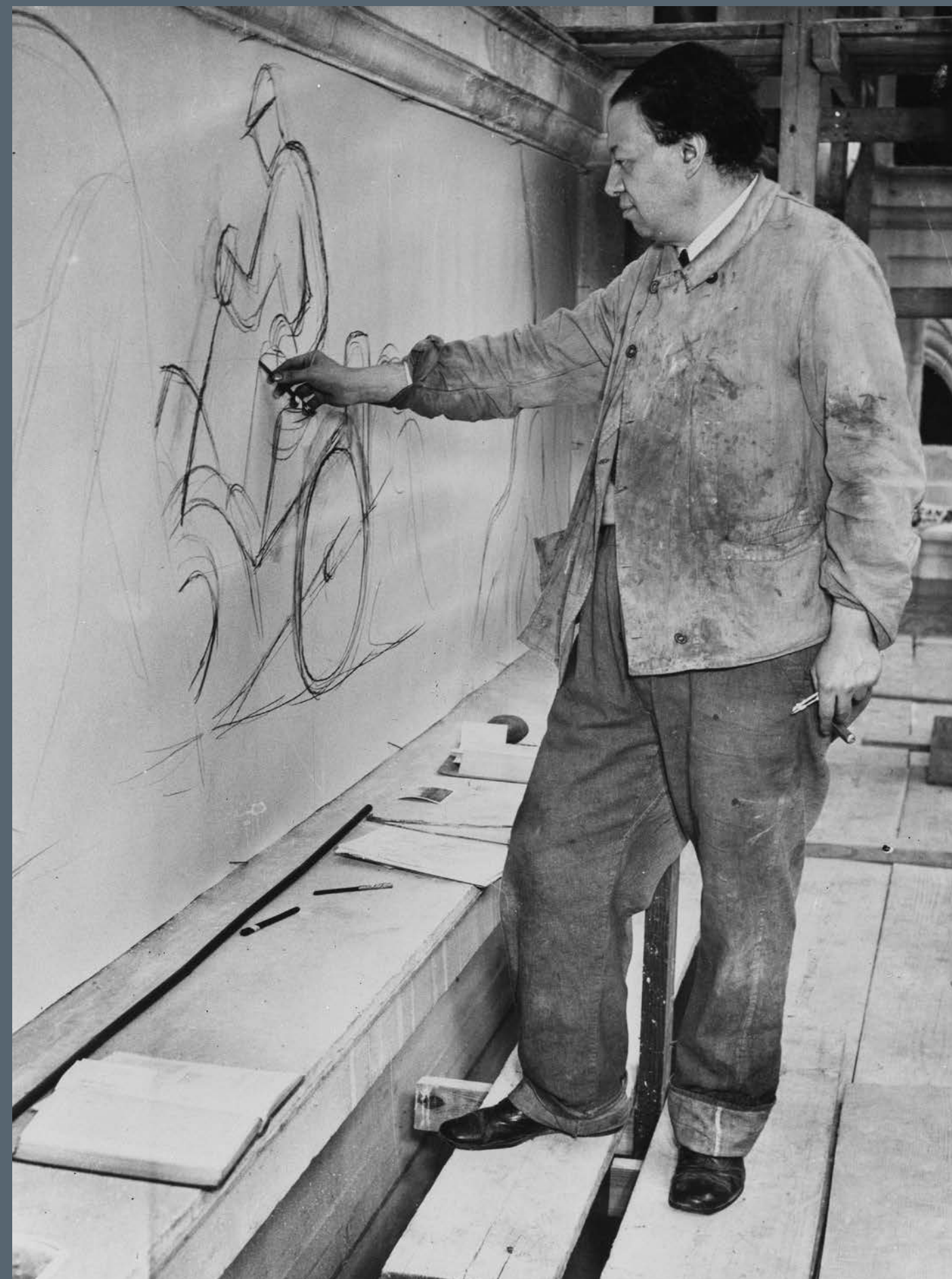
Diego Rivera sketches one of his "cartoons" while on a scaffold.