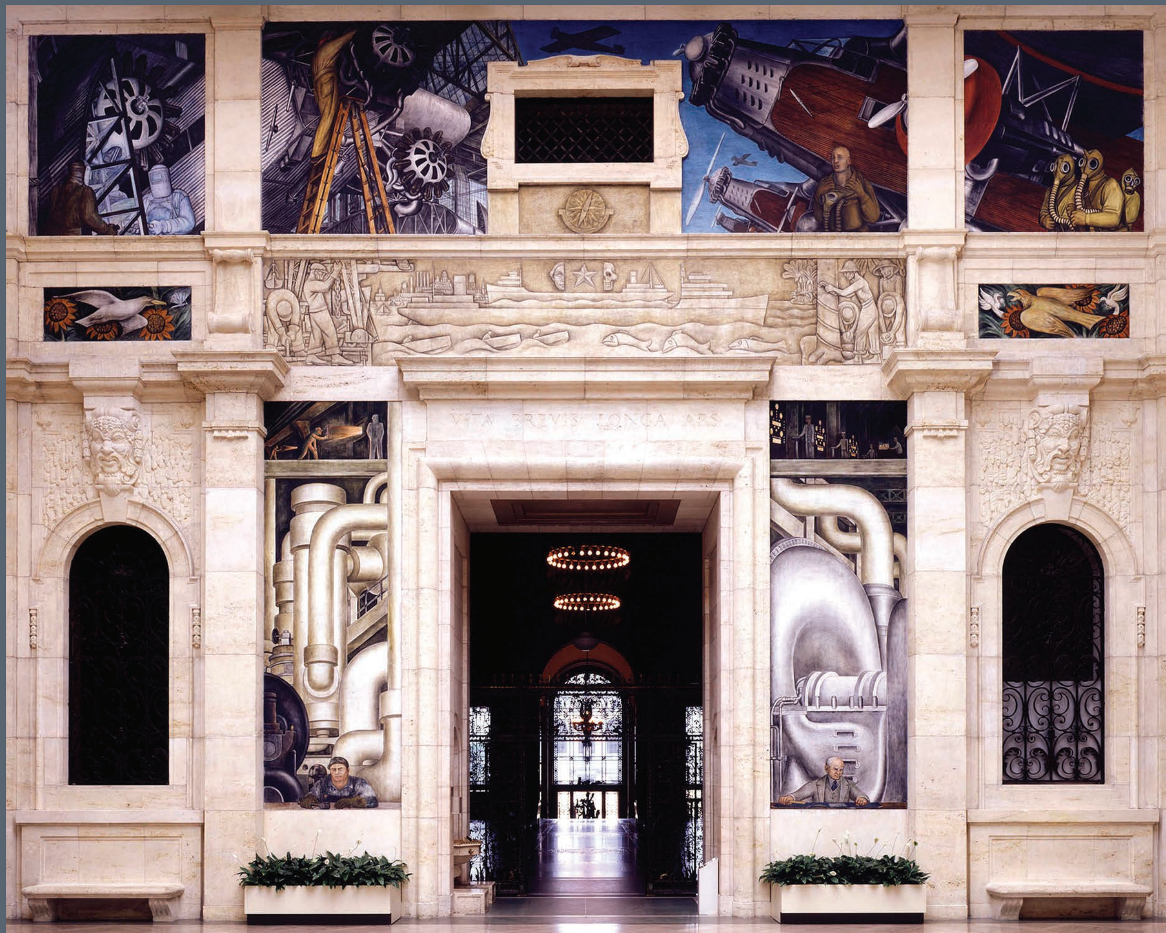
Right: Diego Rivera, "Detroit Industry," west wall, 1932-33, fresco.