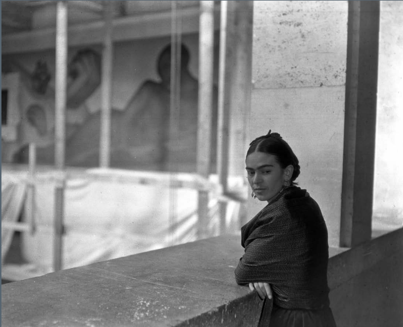
Frida Kahlo on balcony above the Detroit Industry murals.

HS: It is certainly an extraordinary achievement to have done this exhibit at a time of existential economic threat that only got worse while you were mounting it. The achievement recalls the fact that the frescoes of Diego Rivera were themselves initially painted at a similar moment of economic crisis. You have spoken about “art as a shared human experience.” What is your sense of the impact that this exhibit has had in Detroit?