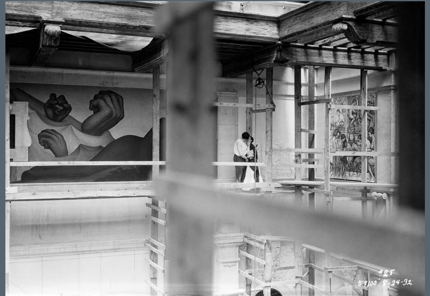
Diego Rivera and Frida Kahlo kiss on the scaffolding.