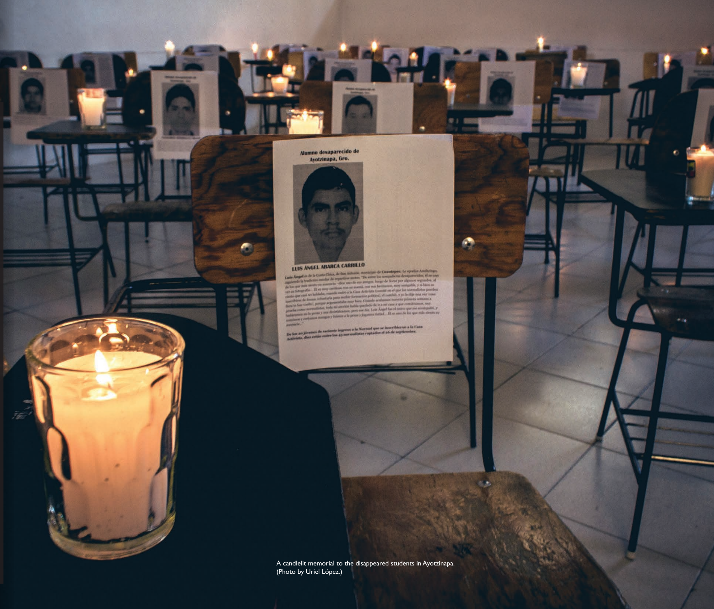
A candlelit memorial to the disappeared students in Ayotzinapa.